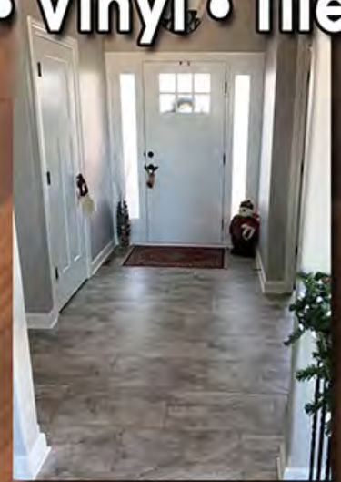
Tile Floors & Entryways