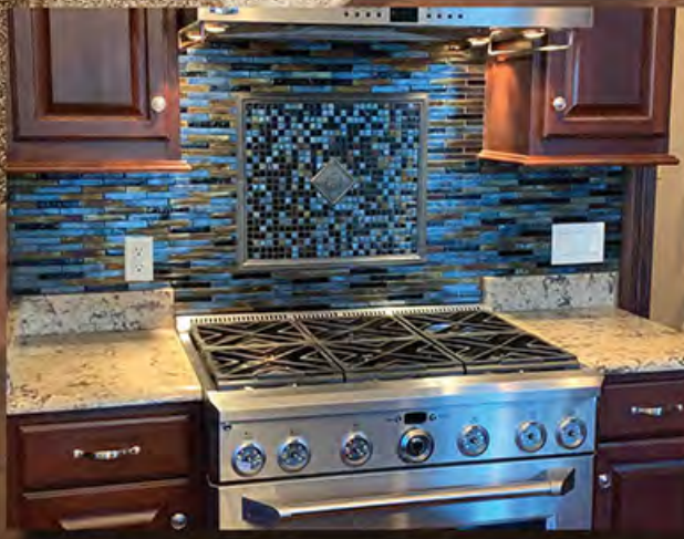
Tile Backsplashes Hardwood Floors Vinyl Flooring Carpeting