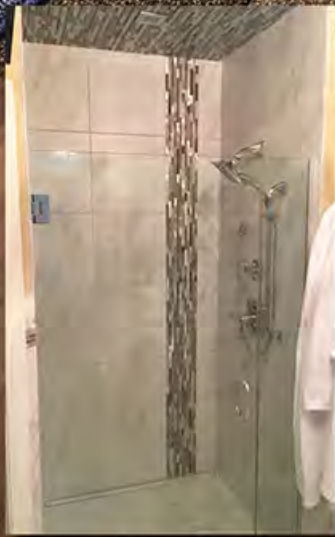
Tile Showers & Bathrooms