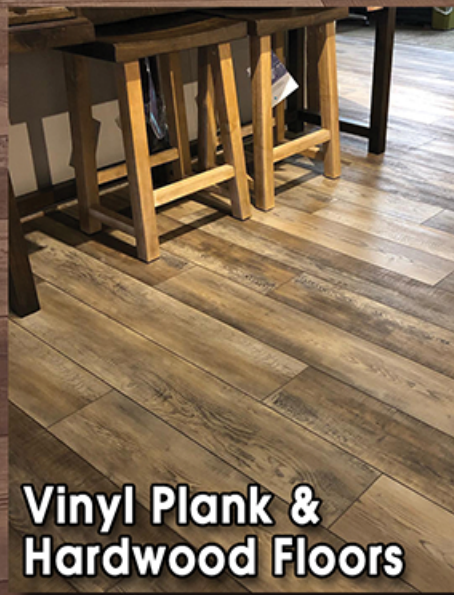
Vinyl Plank & Hardwood Floors