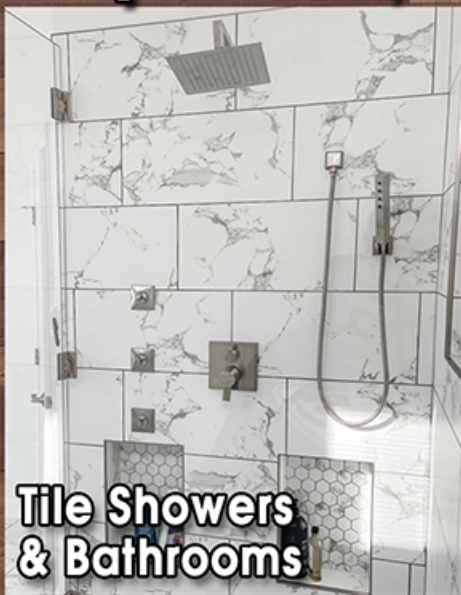
Tile Showers & Bathrooms