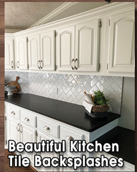
Beautiful Kitchen Tile Backsplashes

Whether it's a kitchen, bathroom, one room, or an entire house, we can take care of your flooring and tile needs!